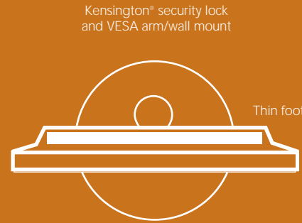
Kensington® security lock and VESA arm/wall mount