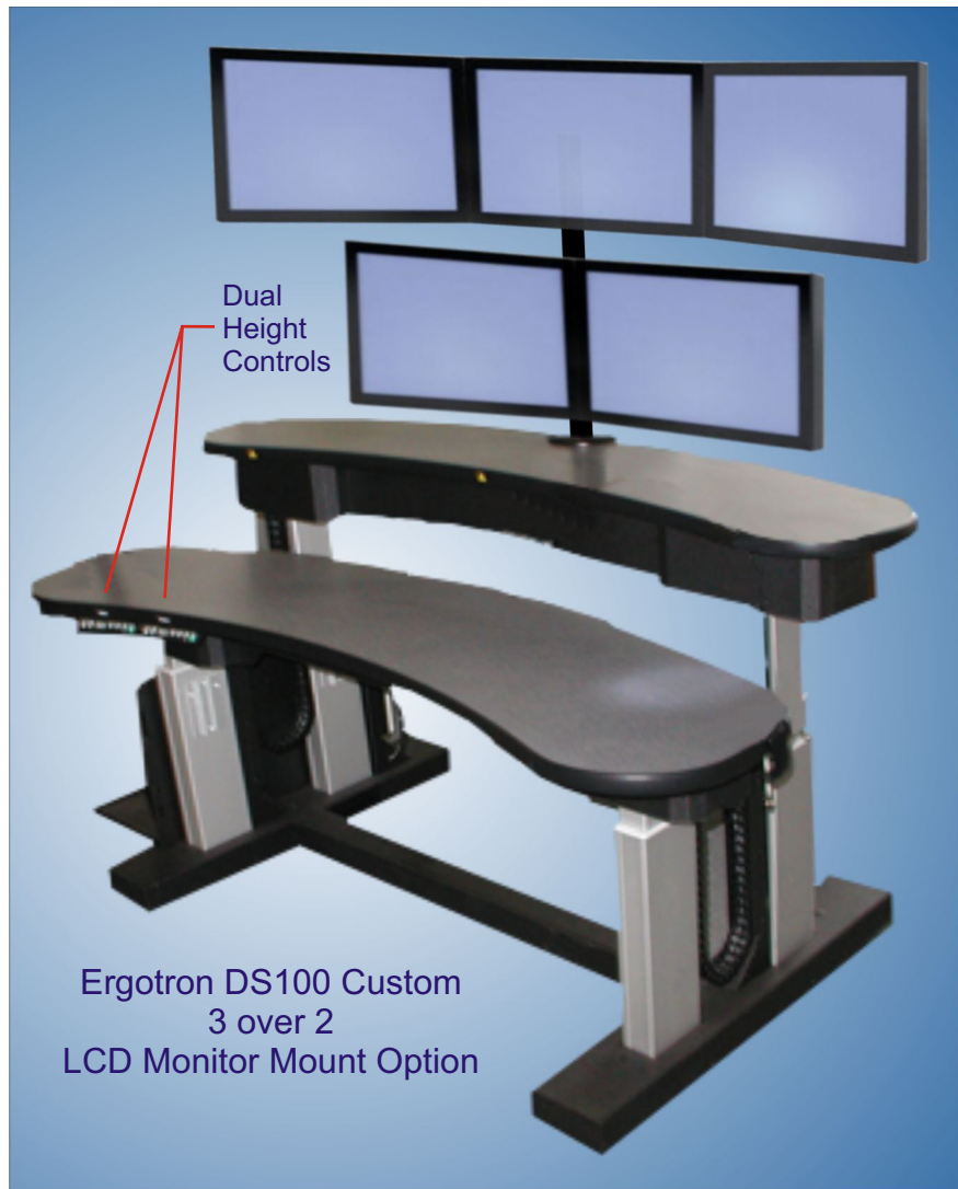
Dual Height Controls