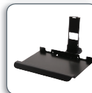
KSA1021 ■ Keyboard Tray Accessory

For a complete list of monitor mount accessories see page 111.