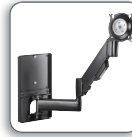
KWGSK110 Height-Adjustable Steel Stud Mount