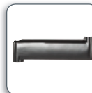
KSA1003 ■ Extension Arm – Maximum of 3 arms – Weight capacity is reduced to 30 lbs (13.6 kg)