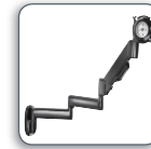
KWB110 Height-Adjustable Triple Arm Mount