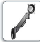
KWV110 Height-Adjustable Single Arm Mount