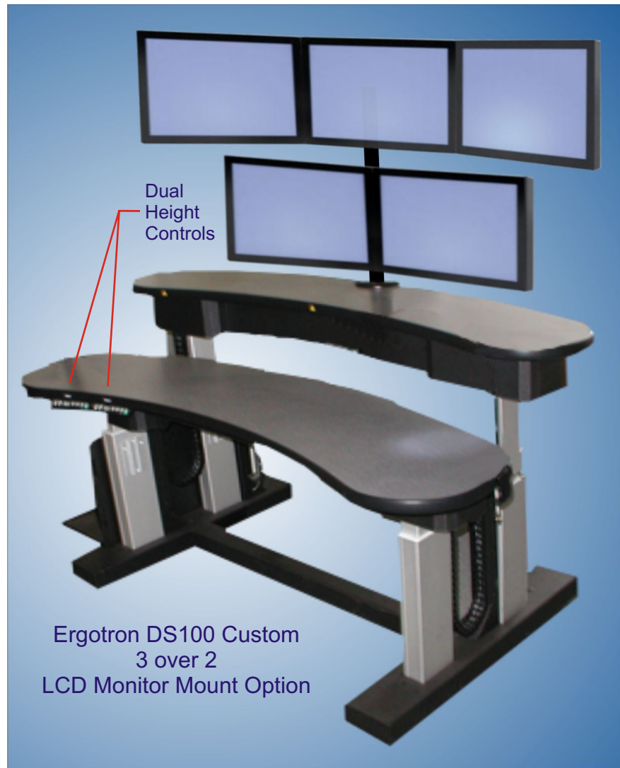
Dual Height Controls